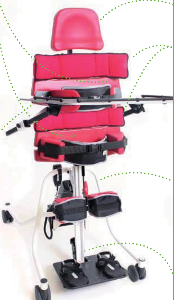
Multistander size 2 in Supine

Angle can be adjusted with the child in the standing frame, and is easily set using the angle gauge on the frame. Frame can be tilted to be completely horizontal, aiding transfers when used in supine. The frame has a smooth gas strut assist on size 1 and a choice of manual or powered on size 2.